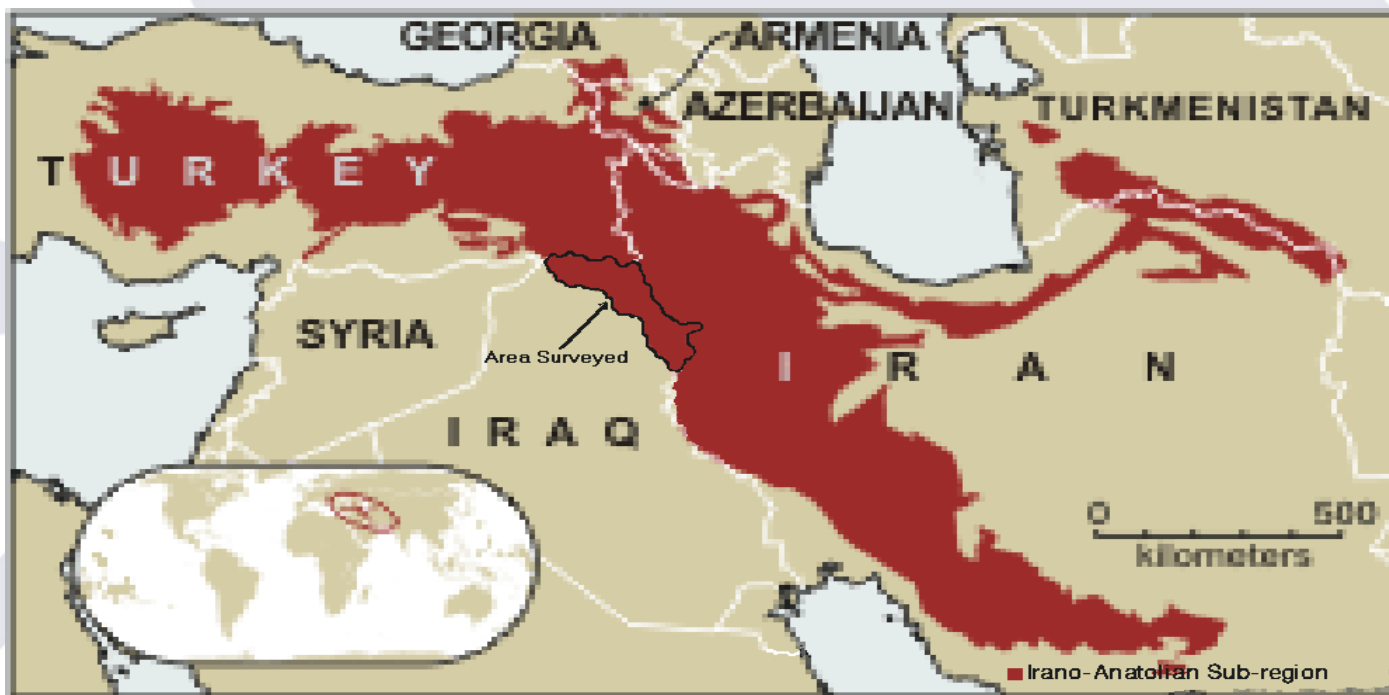
Irano-Anatolian Sub-region (Original map by Conservation International)